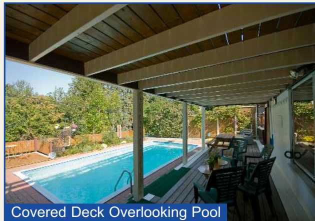
Covered Deck Overlooking Pool