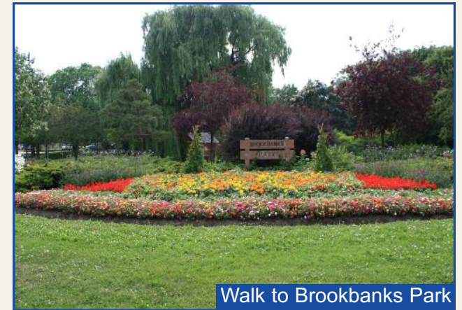
Walk to Brookbanks Park