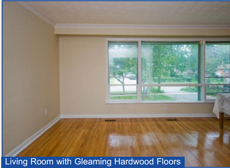
Living Room with Gleaming Hardwood Floors