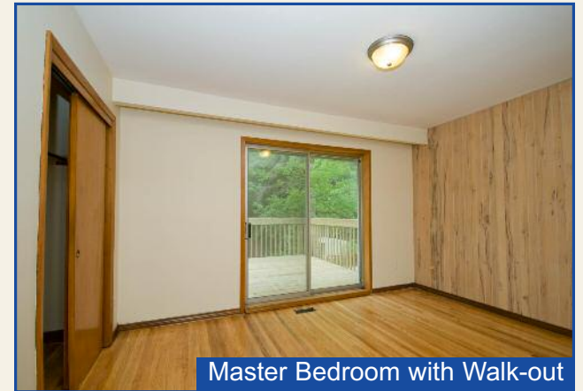
Master Bedroom with Walk-out