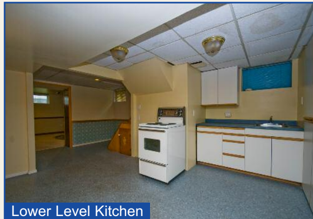
Lower Level Kitchen