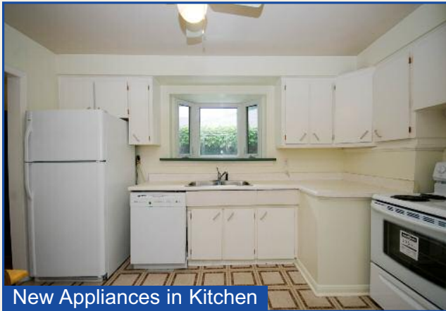
New Appliances in Kitchen