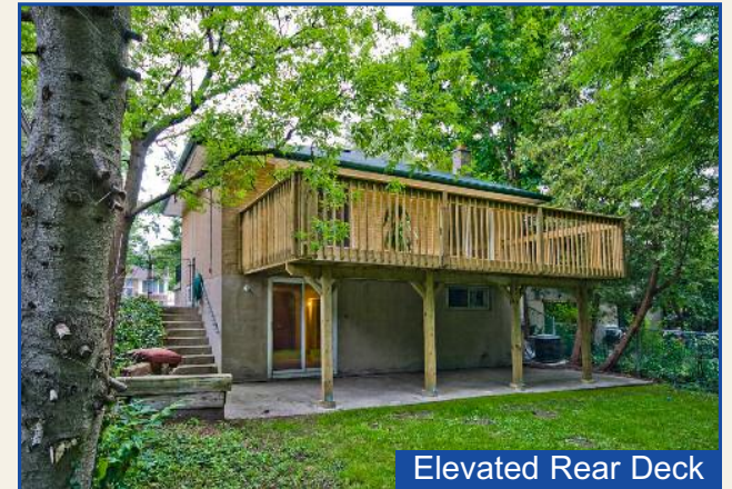
Elevated Rear Deck