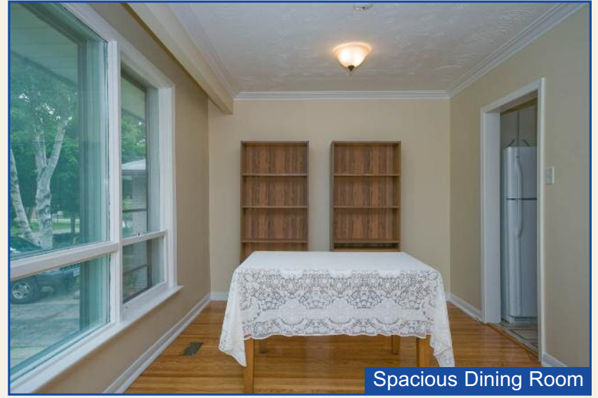
Spacious Dining Room