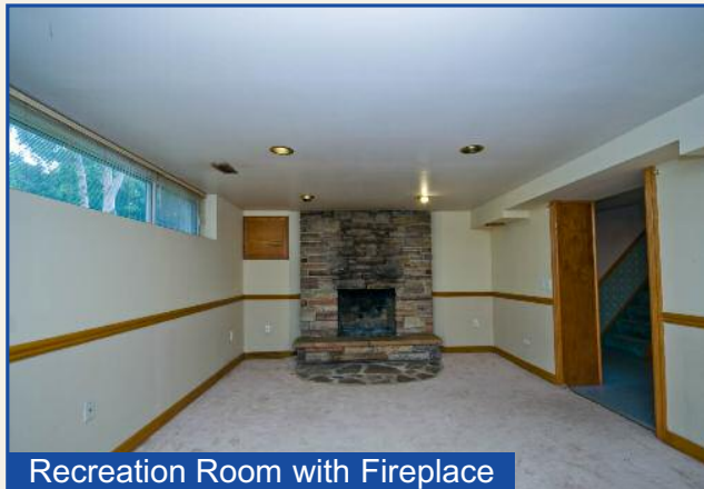
Recreation Room with Fireplace